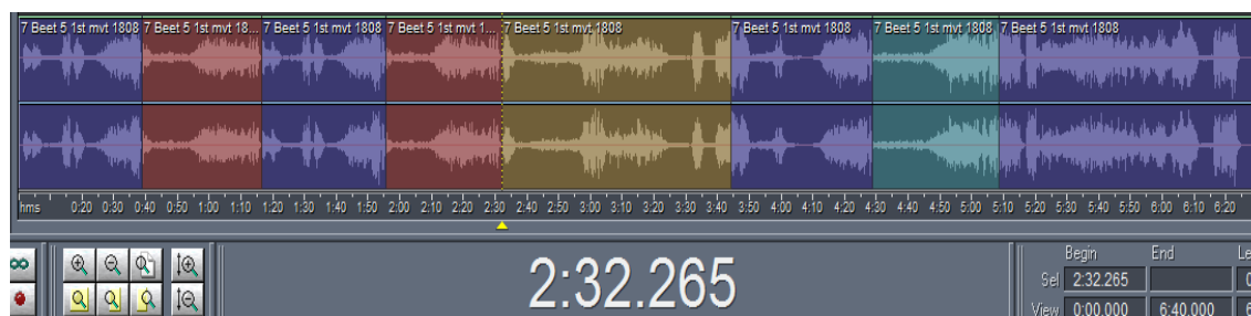
Figure 2: Graphic representation of ‘the Beethoven’ (Beethoven’s Fifth Symphony) in which colours were used to indicate key and structure.